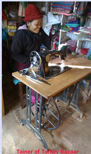
Tainer of Torkey Bazaar