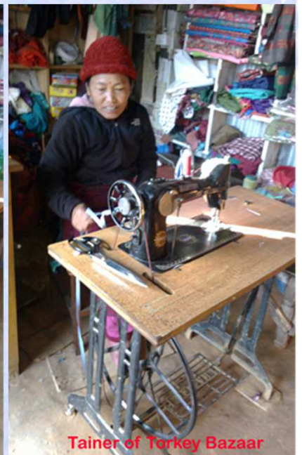
Tainer of Torkey Bazaar